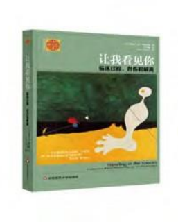
Introduction to the Practice of Psychoanalytic Psychotherapy By Ernest Becker