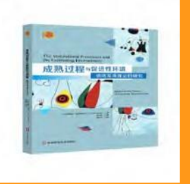
The Maturational Processes and Facilitating Environment By D.W. Winnicott