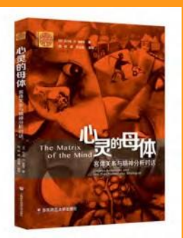
The Matrix of the Mind Practice By Thomas Ogden